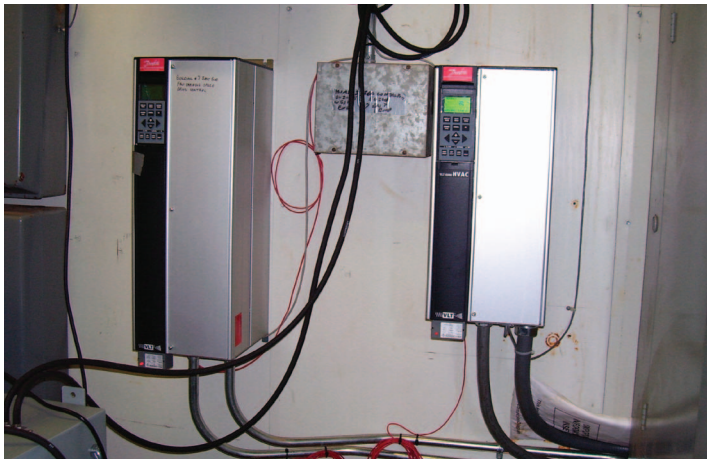
One of the VFD systems installed at Paragon Farms.

sudden and significant change in humidity and temperature. With the VFD control installed the operator can run the fans at a constant speed or adjust the speed according to the potato bin humidity levels and temperature, creating a constant atmosphere. In a study done by the University of Idaho, VFD fan controls were shown to reduce shrinkage by 0.4 percent or more over a storage season. In a sample sited, the load weights increased by 1,200 hundred weight (cwt) and income increased by $6,000 for sales made at $5.00 per cwt.