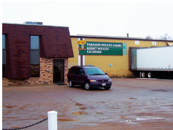
Paragon's grading facility in Plover, WI.

Potato storage is an important factor for the potato industry. Efficient and effective storage is a priority for growers or storage facilities involved in fresh or processed segments of the industry. The role of potato storage is to maintain both the quality and quantity of potatoes throughout the storage period. Both quality and mass loss (shrinkage) are linked to profitability for an operation.