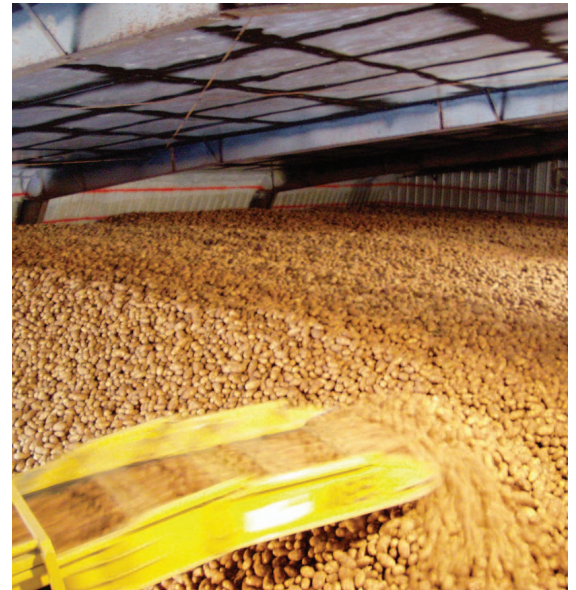
A potato bin being filled for winter storage.

Each potato bin or storage unit at Paragon Farms has a ventilation system that exchanges air within the bin. The old fan system would run at full speed – cycling on and off – four times a day which produced a