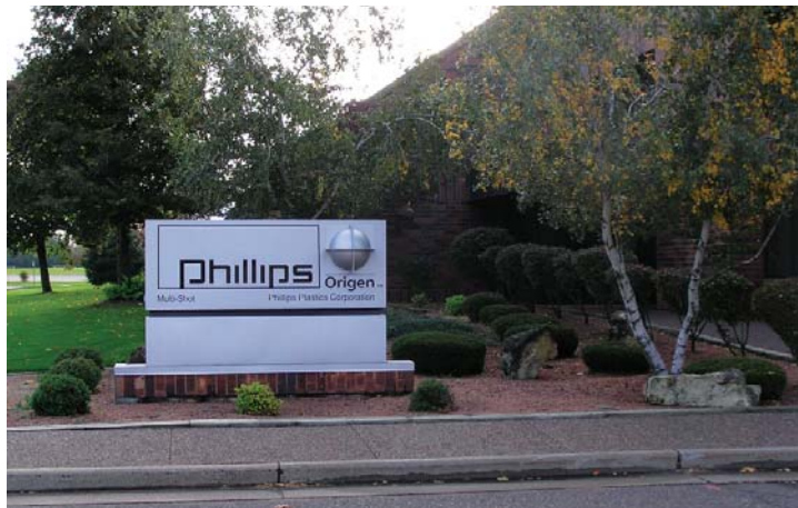
The Multi-shot facility is one of over ten manufacturing locations Phillips Plastics has in Wisconsin.

The total cost for the system was $145,000. With an estimated savings of $31,809 in annual energy costs, and a Focus on Energy incentive of $15,066, payback on the installation is just over four years.