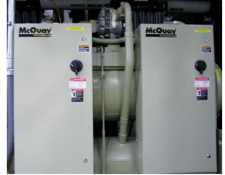
Energy efficient McQuay turbo core chiller providing process chilled water for the plastics industry.

Pre- and post-installation metering, verification of vendor's energy calculations, project grant