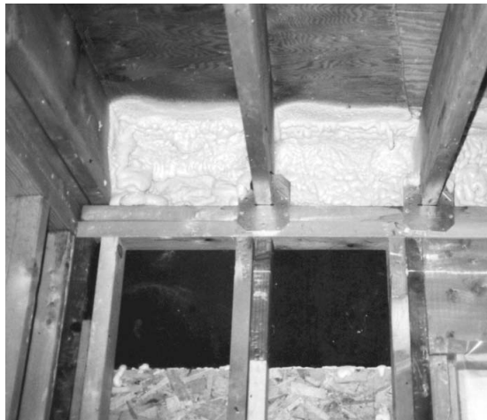
Insulating the sill box with spray-in foam.

This form of insulation requires special equipment, which either sprays or extrudes (forces) foam into the wall, floor or attic cavities. In addition to slowing the passage of heat, this type of insulation also seals spaces from air infiltration.