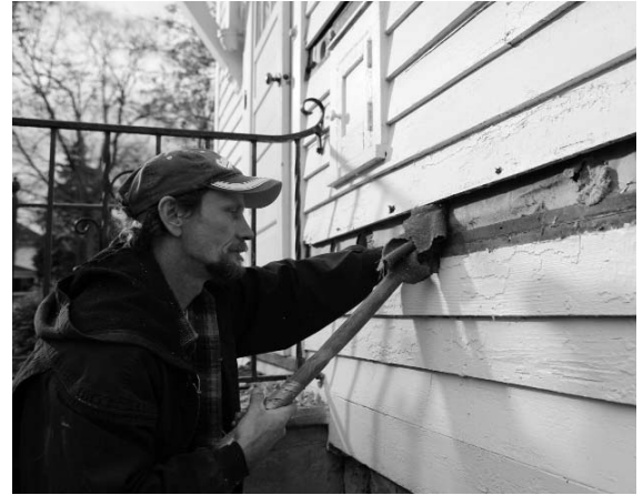
Installing sidewall blow-in insulation.

Keeping outside air from entering your home involves two tasks—sealing hidden building cavities and closing narrow spaces around windows and doors. Sealing hidden building cavities usually requires a professional blower door test to find the places that need sealing. A blower door is a panel-mounted fan that fits into an exterior