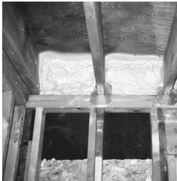
Insulating the sill box with spray-in foam.

This form of insulation requires special equipment, which either sprays or extrudes (forces) foam into the wall, floor or attic cavities. In addition to slowing the passage of heat, this type of insulation also seals spaces from air infiltration.