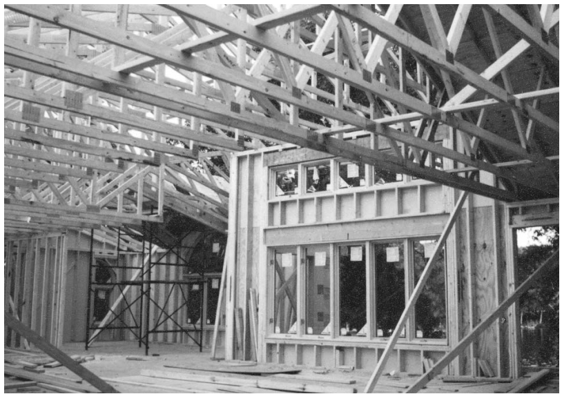
Stick-frame house during construction. Later, wall and ceiling cavities will be sealed and insulated.

Insulation is essential to lowering heating and cooling bills. The most important places to insulate (in order of priority) are the attic, walls, floors above unheated spaces, sill box and the basement. The sill box is the space where the floor joists meet the foundation wall.