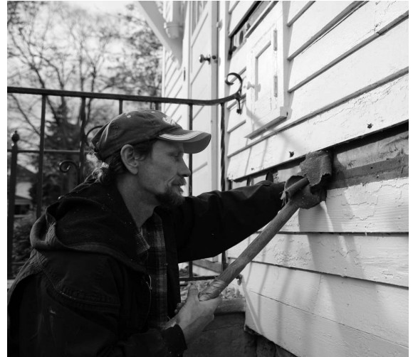
Installing sidewall blow-in insulation.

Keeping outside air from entering your home involves two tasks—sealing hidden building cavities and closing narrow spaces around windows and doors. Sealing hidden building cavities usually requires a professional blower door test