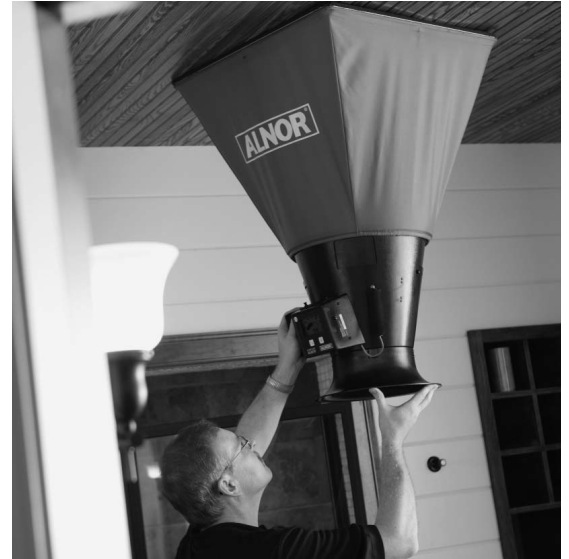
A consultant partnering with Home Performance with ENERGY STAR® measures exhaust ventilation airflow to ensure the system performs correctly.

For example, testing has shown that many exhaust fans don't draw out enough air, due to improper sizing, problems with ductwork or other reasons. Some exhaust fans draw