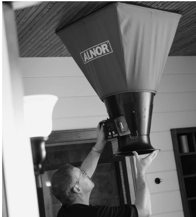
A consultant partnering with Home Performance with ENERGY STAR® measures exhaust ventilation airflow to ensure the system performs correctly.

Excess moisture in the home can contribute to a variety of problems: mildew, odors, frost and ice on cold surfaces, ice dams on roofs, and more. Left unchecked, these problems can lead to structural damage.